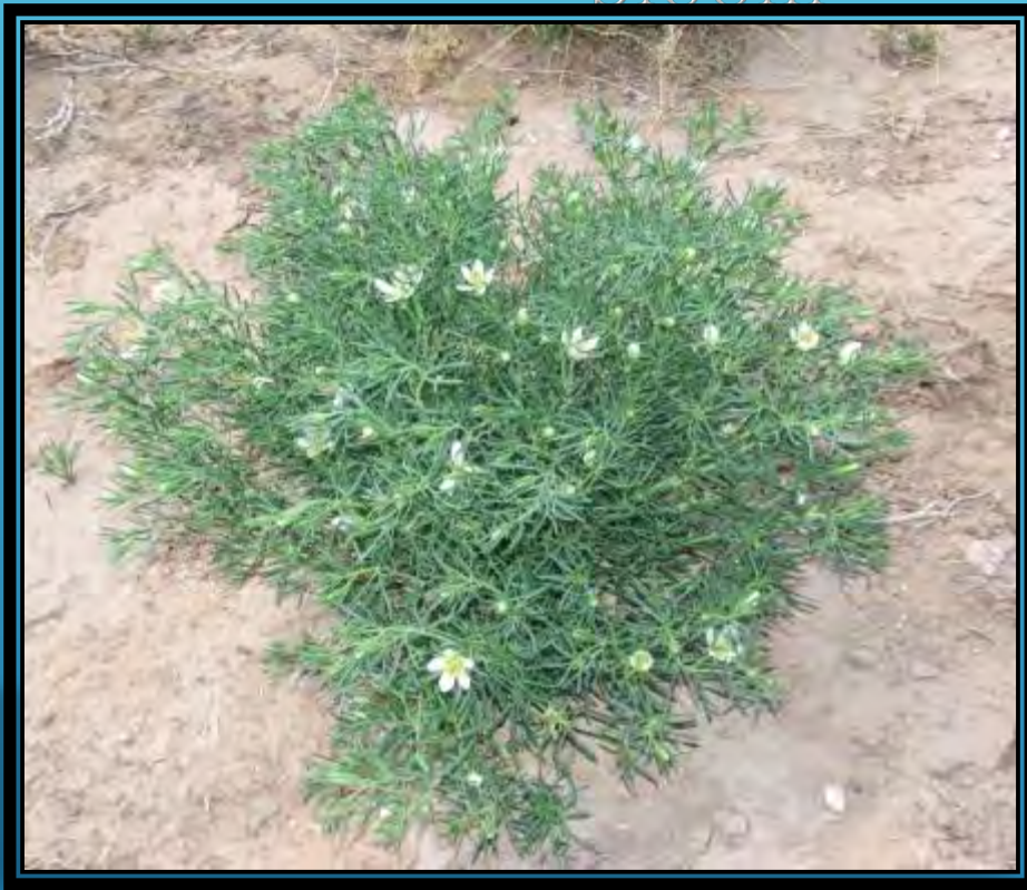
African Rue in full bloom