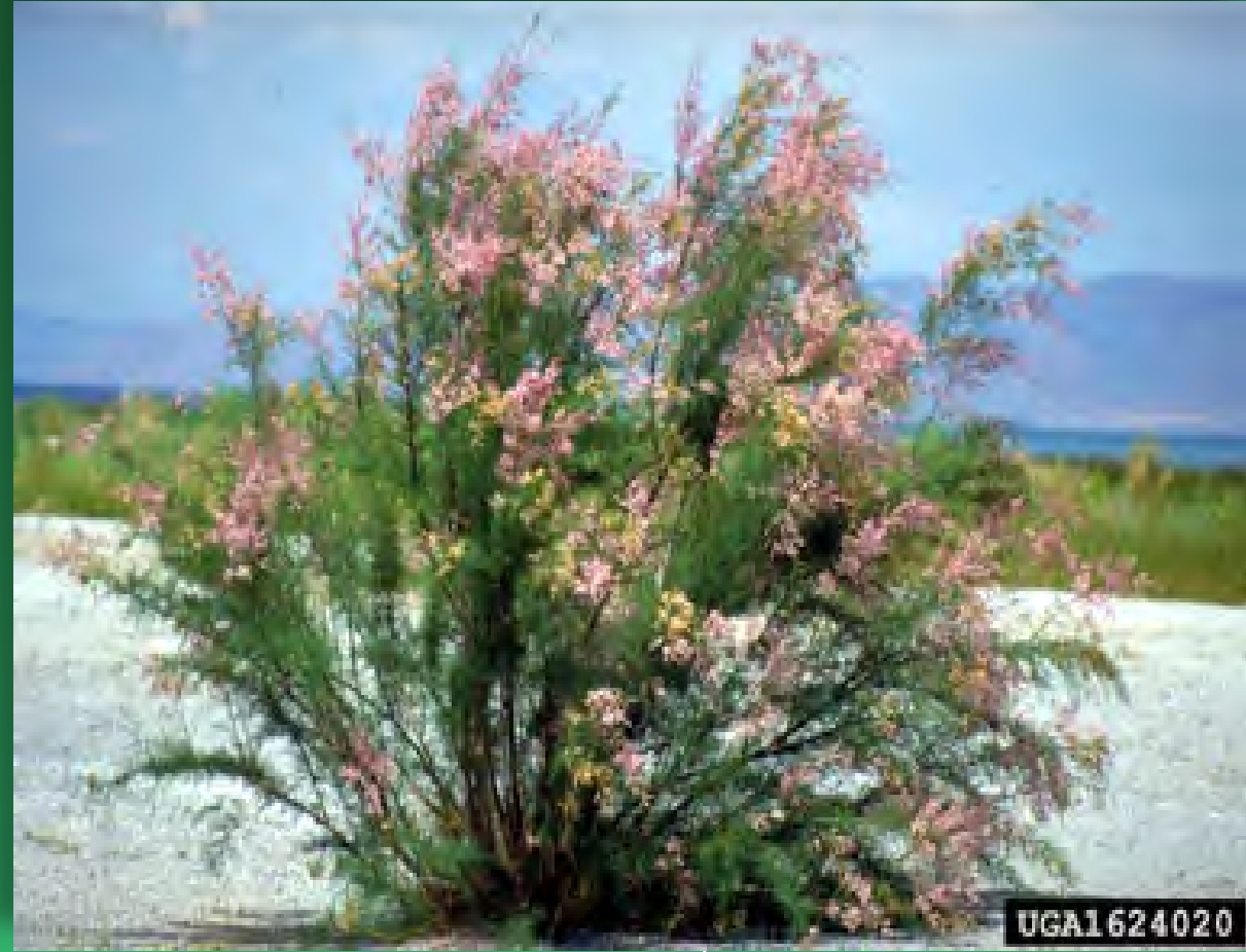
Typical salt cedar trees in bloom.